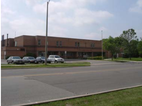
To Welcome You

In order to welcome you, to prepare our earth, to believe in you, great Lord, Nothing extraordinary need be done.